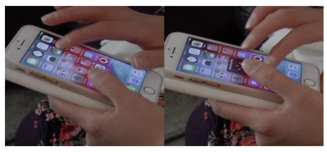
Figure 2. Performing gestures with both hands: tapping with left thumb and swiping with right index.

This fragment displays P5's preferred practice to communicate with others via text message, which is accomplished through VoiceOver. As a screen reader expert user, P5 has set the speech rate with which the screen reader narrates the content to a fast pace [9]. Initially P5 performed a series of combined gestures to decrease the speech rate for the researcher. Not only the gestures were complex, but they were also performed in a very short time, demonstrating proficient use. Moreover, P5 continuously used the shortcut to stop the screen reader output (i.e. two fingers in the middle of the screen), which allowed her to continue with the demonstration. Lastly, we note the method she uses to locate elements on the screen (Fig 3) that allows her to conduct the task.