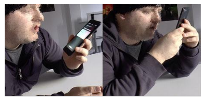
Figure 1. a) P1 using Siri (left) and b) demonstrating interaction he avoids in public (right).

In this fragment we note that although P1 is partially sighted and can see the screen's visual interface, he needs to put the screen very close to his face in order to do so (Fig 1b) and therefore prefers to use Siri. P1 provides multiple accounts for his preference here: improved "confidence" but also convenience ("it saves me going into my phone") when he is in public. So, in P1's account, voice assistant capabilities are to be mastered so as to provide for social acceptability by others (we note the imposition of particular normative behaviours often experienced by those with disabilities). This is in tension with the enhanced flexibility of interaction that voice assistants provide. It is also important to note, the way in which P1 articulates his message, by employing brief pauses that might indicate a comma or period, however, these are not captured as such by the assistant. Moreover, as he frequently uses Siri with and without VoiceOver enabled, he recognises the differences between such modalities, in which the latter allows him to revise the message before sending it, by listening to it instead of looking at the screen.