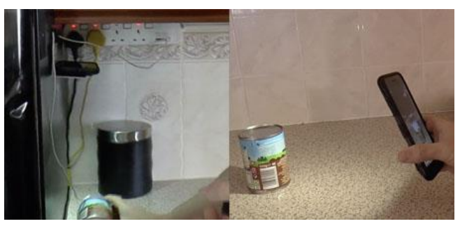
Figure 4. Using Seeing AI to read a tin label: a) with phone attached to a shelf (left) and b) holding phone with hand (right).

P2: See the difference between putting it on there [points shelf] and put it like that [points the tin on the counter]. The time taken is ridiculous.